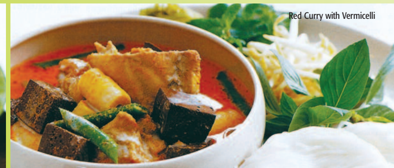
Red Curry with Vermicelli